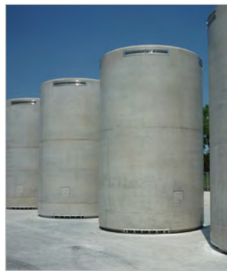
NAC cask systems incorporate unique design, fabrication, and operations features.