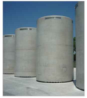
NAC cask systems incorporate unique design, fabrication, and operations features.